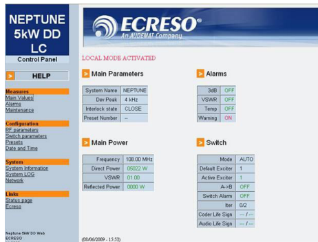
Remote access to configuration

The new technology they use, does not prevent them from being affordable.